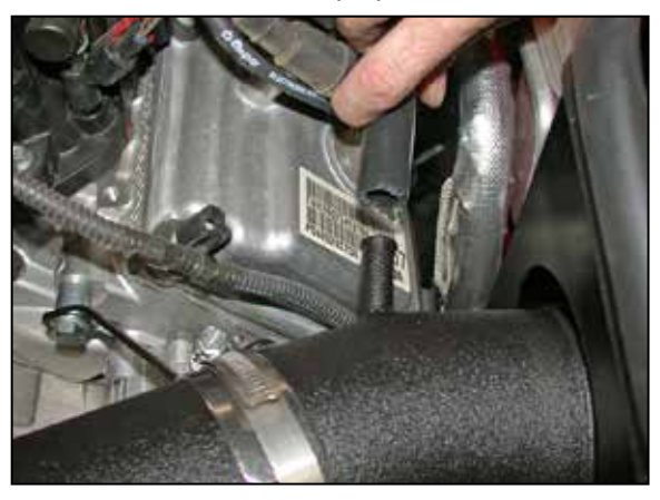
19. Install the provided crank case vent hose onto the vent port on the valve cover then install the vent hose onto the K\&N^{\mbox{\ensuremath{\$}}} intake tube.

18. Install the K&N<sup>®</sup> intake tube into the throttle body and onto the saddle clamp as shown, then secure with the hose clamps provided.