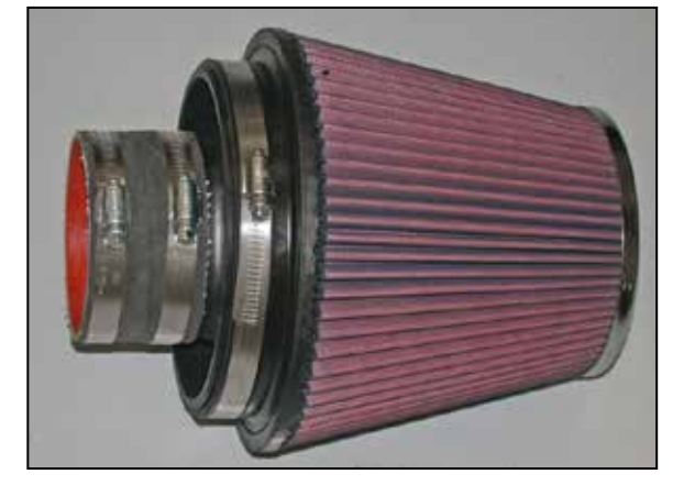
21. Install silicone hose (08630) onto the air filter assembly and secure with the provided hose clamp.