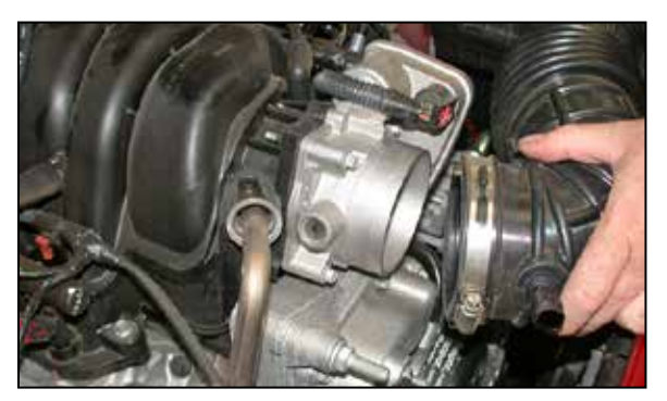
4. Loosen the hose clamp that secures the intake tube to the throttle body and pull the intake tube off of the throttle body.