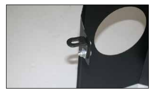
9. Install the "L" bracket (070066A) onto the heat shield with the provided hardware through the non-slotted hole in the bracket.