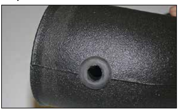
16. Install the provided grommet into the K\&N^{\circledast} intake tube as shown.

15. Remove the air temperature sensor from the factory intake tube.