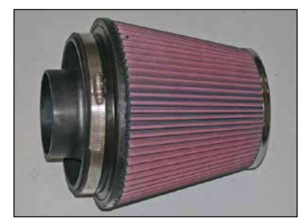
20. Install the filter adapter into the air filter and secure with the provided hose clamp.