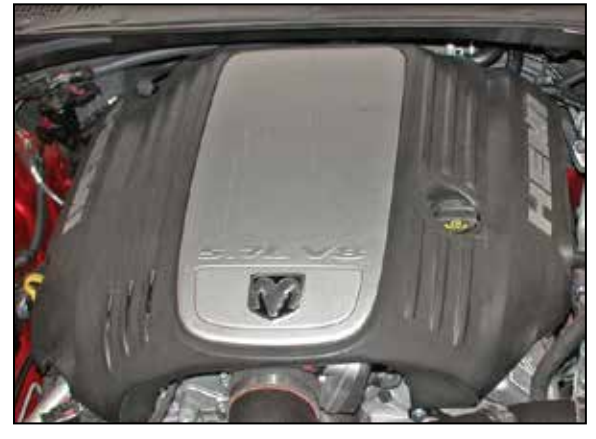
24. Reinstall the engine cover removed in step #2.