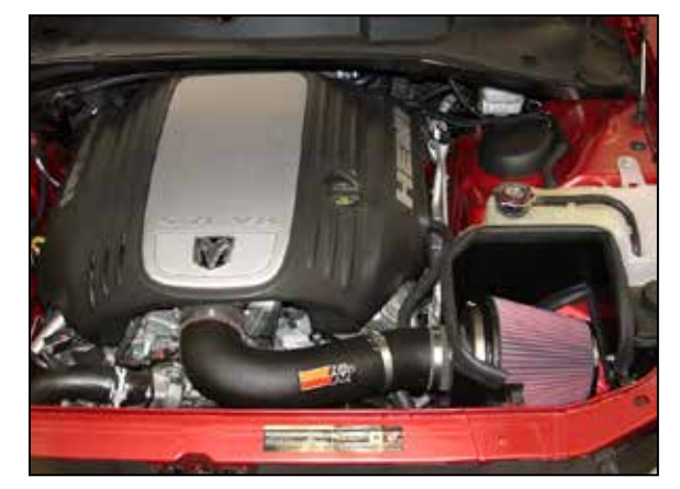
25. Reconnect the vehicle's negative battery cable. Double check to make sure everything is tight and properly positioned before starting the vehicle.

26. The C.A.R.B. exemption sticker, (attached), must be visible under the hood so that an emissions inspector can see it when the vehicle is required to be tested for emissions. California requires testing every two years, other states may vary.