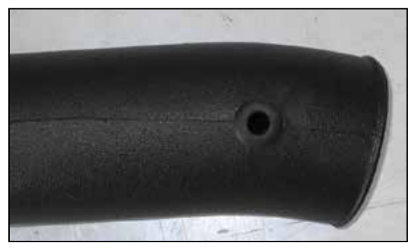
16c. On SRT 8; 6.1L equipped vehicles, install the provided grommet into the 0.75" ID hole as shown.

16b. Drill out the hole in the intake tube to 0.75".