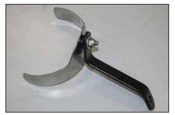
12. Assemble the tube mounting bracket and saddle clamp as shown with the provided hardware.

11a. Due to vehicle manufacturing tolerances, the A/C lines on some vehicles may need to repositioned slightly so that they do not contact the heat shield. To adjust, grab the A/C line on the aluminum section and carefully apply pressure in the desired direction until clearance is obtained.