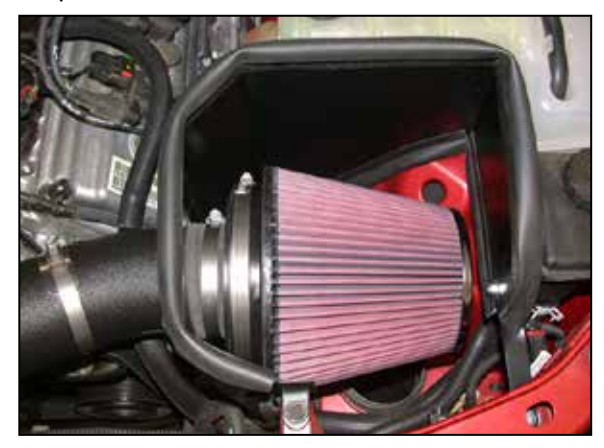
22. Install the air filter assembly onto the K&N<sup>®</sup> intake tube and secure with the provided hose clamp as shown.