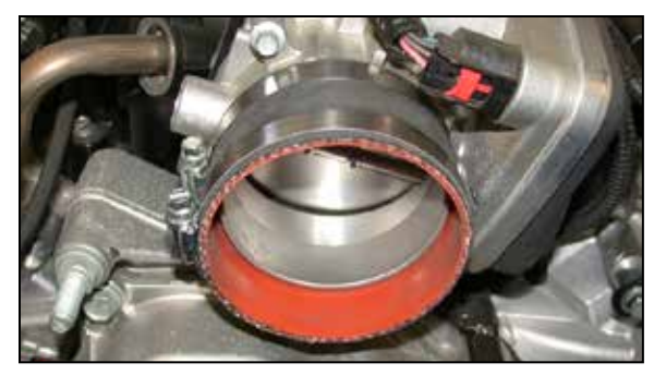
14. Install the silicone hose (08630) onto the throttle body and secure with the provided hose clamp as shown.

13. Using the provided spacer, install the tube mounting bracket assembly onto the engine as shown.