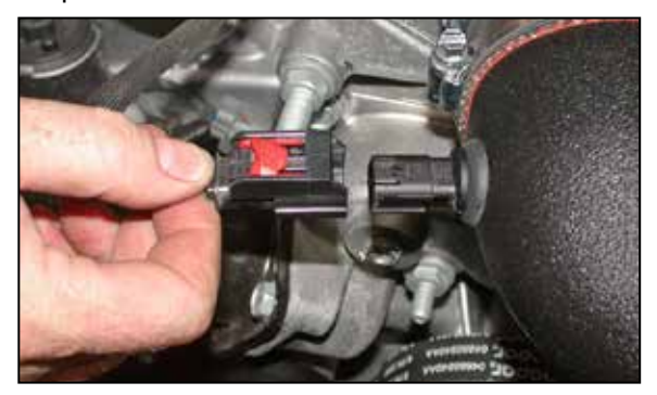
23. Reconnect the air temperature sensor electrical connection as shown.