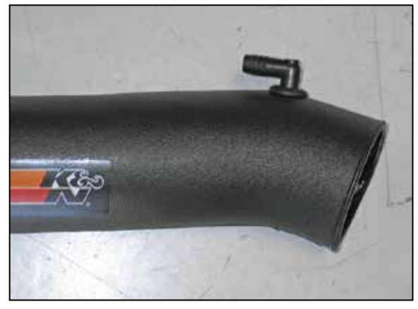
16d. On SRT 8; 6.1L equipped vehicles, install the provided 90° hose mender as shown.