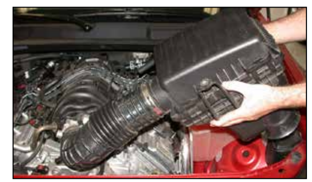
6. Loosen and remove the air box mounting bolt as shown.

2. Lift up on the engine cover to loosen it from the mounts, and then remove the cover from the vehicle.