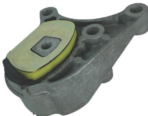
Figure 2: Attach washer to top of insert