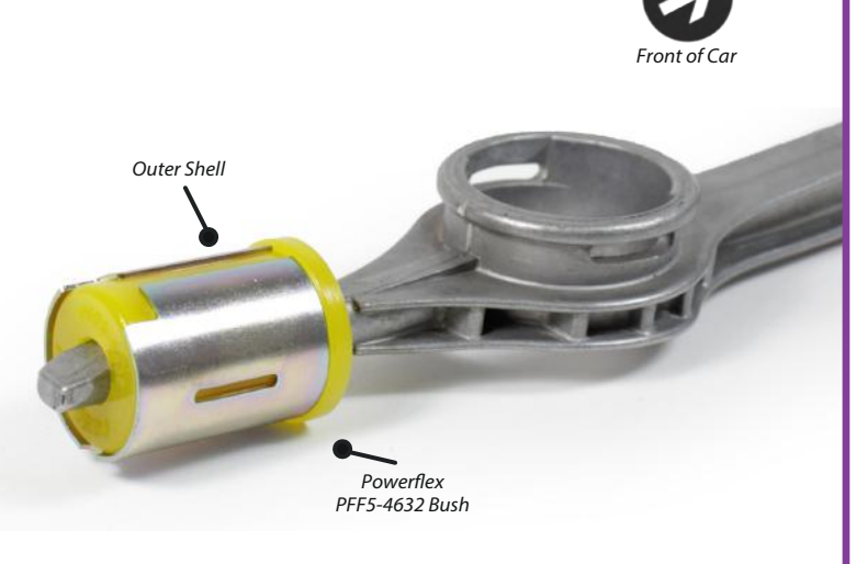
Figure 2 - PFF5-4632 Fitted Image