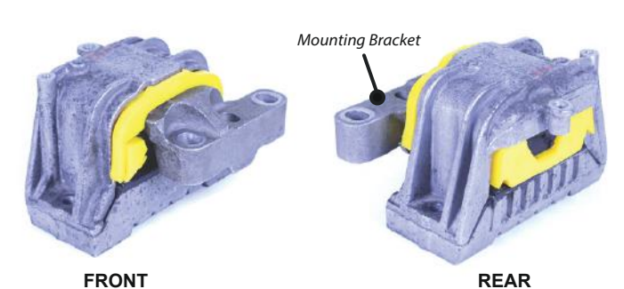
Figure 2 - showing how part A and part B lock into each other in the engine mount

POWERFLEX +44 (0) 1895 460033 sales@powerflex.co.uk