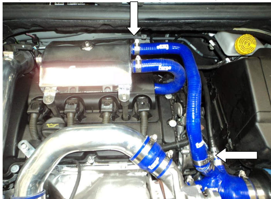
Installation is now complete.

6. Now fit one end of the long silcon pipe to the rear outlet on the oil catch can and the other end to the turbo intake pipe. Use the number 30 hose clamp for the catch can end and hose clamp number 35 for the turbo intake end. Tighten both clamps with a hose clamp joiner.